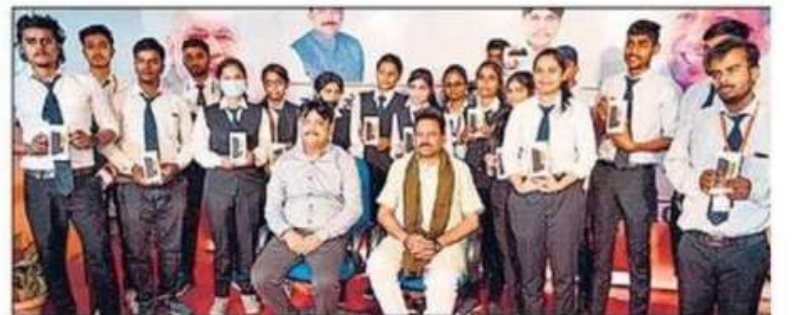
माइक्रोटेक कॉलेज में बुधवार को स्मार्टफोन के साथ विद्यार्थी व विशिष्टजन।