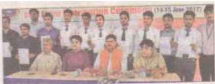
कैम्पस प्रेसमेंट के कार विद्यापीठ के साथ युवा जगत माइक्रोटेक कॉलेज के छात्र।